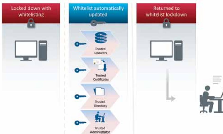
Figure 2. McAfee Application Control uses a dynamic trust model to simplify the whitelisting process and eliminate manual whitelist administration.

McAfee Application Control blocks unauthorized access to system resources and foils advanced persistent threats using sophisticated whitelisting technology. In the context of legacy database protection, it locks down the database's underlying operating system, allowing only authorized staff and update processes to make operating systems modification. McAfee Application Control software also prevents whitelisted applications from being exploited via memory buffer overflow attacks—a common hacking technique. Plus, it provides an audit trail of all unauthorized change attempts.